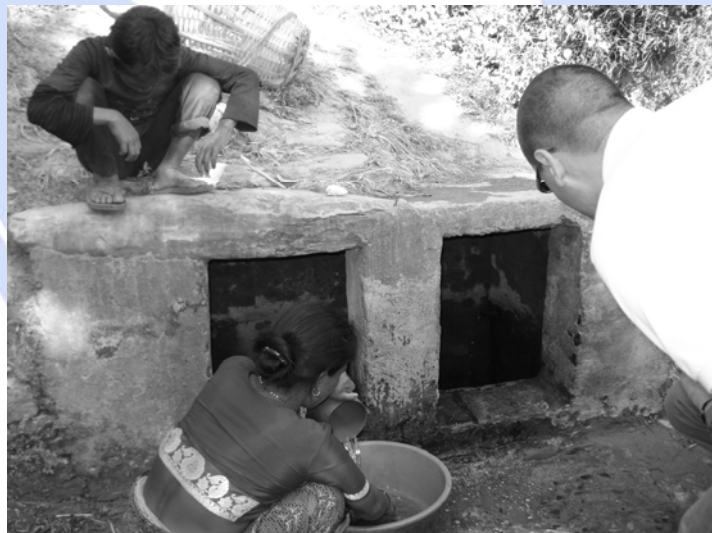
Figure 2: Bhalakhalak spring water collection point, with vulnerability to surface runoff intrusion.

Sonbarshi village is part of the Guari VDC located in Nepal's Kapilvastu District, in the south-western region of Nepal. The village is in an extremely remote location, roughly 8 km from the nearest town. The village is located within the Terai region of Nepal and roughly 10 km from the border with India. The survey indicated that the population is 528 people living in 66 households. Farming is the main source of income. It has been estimated that roughly 80% of the households survive on less than 100 Nepali rupees (NRS) (< £1) per day. The VDC has installed a number of shallow wells. Drainage is very poor. Obstructions in drainage channels cause water to overflow, which damages property and causes pooling on the main route through the village. The pools are insect breeding sites. Sickness and disease is apparent throughout the community; the children have visible skin diseases, respiratory and ear and throat infections. The illnesses are most severe during the monsoon season; the highest instances of conjunctivitis and diarrhoea are at that time of year.