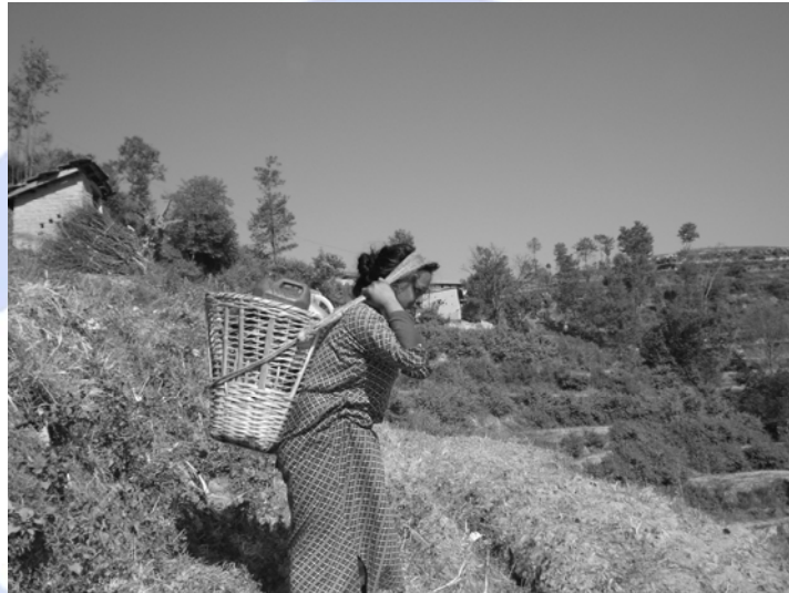
Figure 1: A woman in Bhalakhalak carrying containers to the spring site on a steep mountain path.